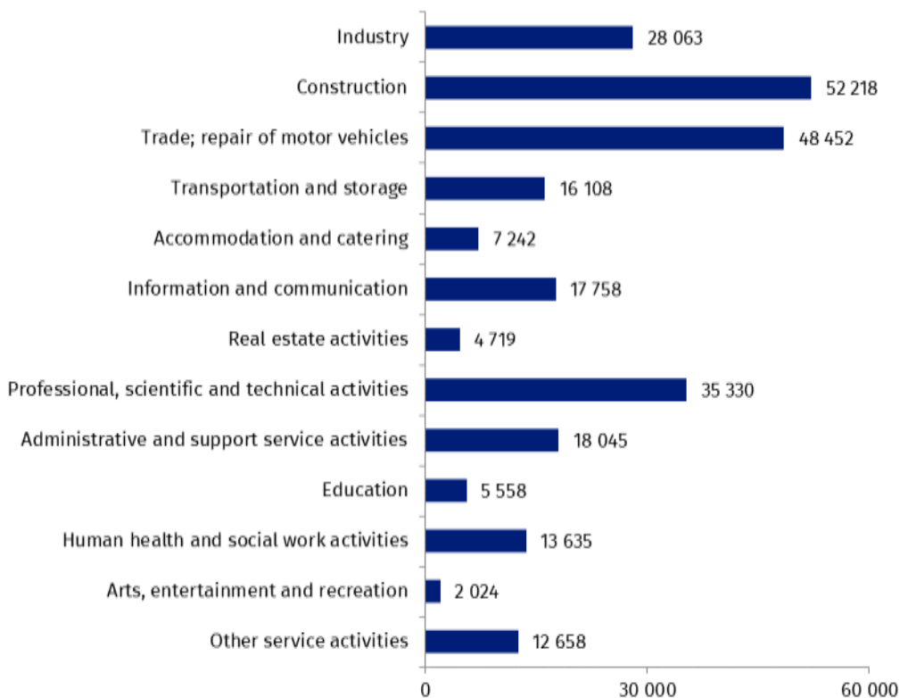
Chart 1. Number of persons employed in enterprises established in 2020 and active until 2021

According to the predominant kind of activity, the highest number of persons employed was in enterprises that conducted activity in sections: construction (52 218 persons), trade; repair of motor vehicles (48 452 persons) and professional, scientific and technical activities (35 330 persons).