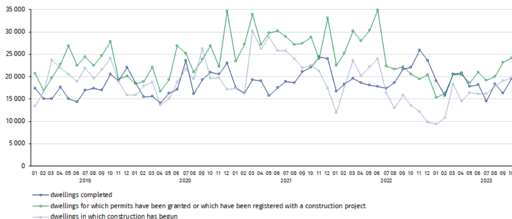
Chart 1. Residential construction in Poland

In October, compared to September 2023, the number of dwellings completed, the number of dwellings for which permits have been granted or which have been registered with a construction project as well as the number of dwellings in which construction has begun increased (respectively by 19.7%, 3.9% and 3.3%)