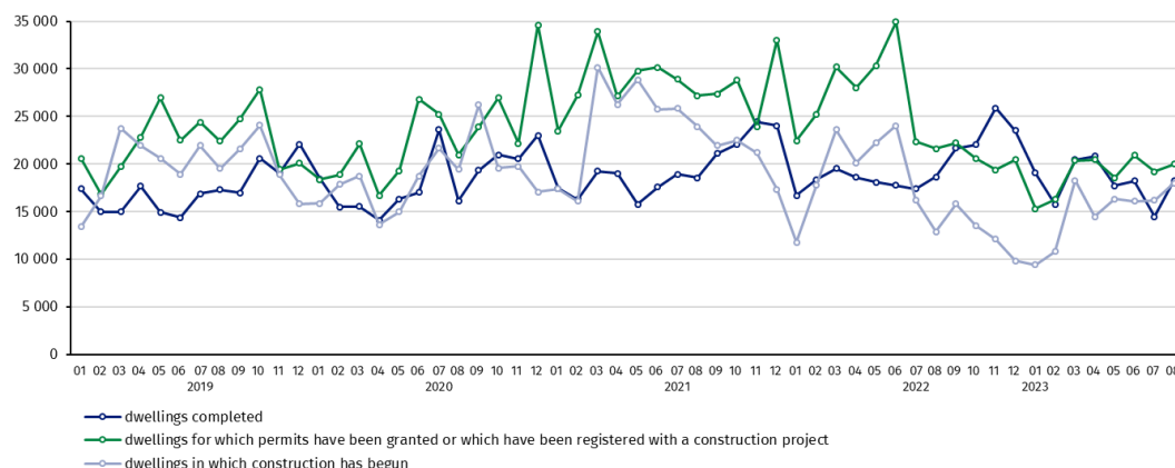
Chart 1. Residential construction in Poland

In August, compared to July 2023, the number of dwellings completed increased (by 26,5%) as well as the number of dwellings in which construction has begun and the number of dwellings for which permits have been granted or which have been registered with a construction project (respectively by 11.1% and 4.2%)