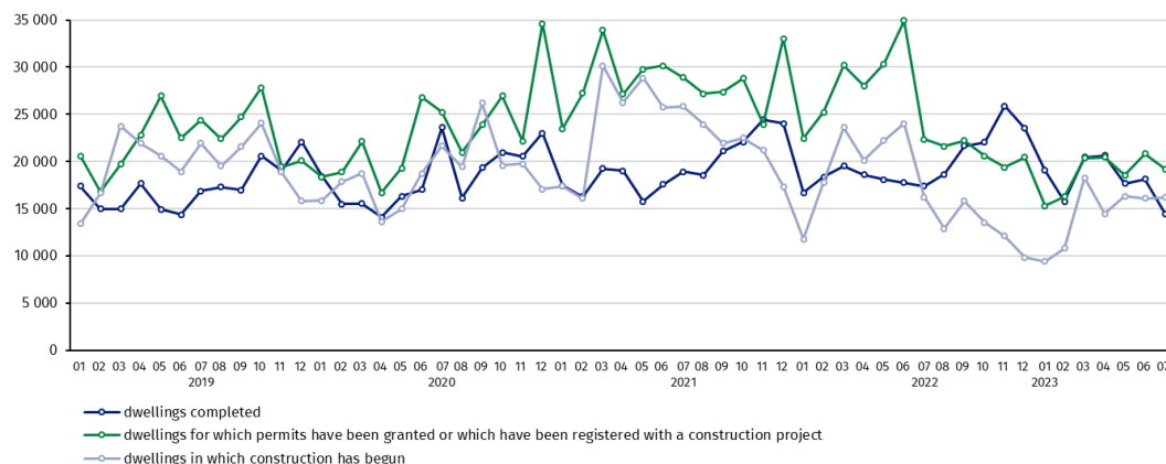
Chart 1. Residential construction in Poland

In July, compared to June 2023, the number of dwellings completed decreased as well as the number of dwellings for which permits have been granted or which have been registered with a construction project (respectively by 20.2% and 8.0%), whereas the number of dwellings in which construction has begun increased (by 0.3%)