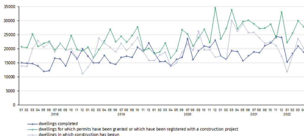
Chart 1. Construction activity in the scope of residential construction in Poland

In April, compared to March 2022, the number of dwellings completed decreased (by 10.7%), as well as the number of dwellings for which permits have been granted or which have been registered with a construction project (by 7.4%) and the number of dwellings in which construction has begun (by 14.6%)