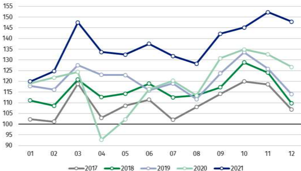
Chart 1. Sold production of industry (average monthly level in 2015=100)

In December 2021, an increase of production, as compared to previous year, was recorded in all main industrial groupings. The highest growth was observed in production of energy – by 39.4%. The lower increase was observed in production of intermediate goods – by 17.6%, capital goods – by 12.6%, non-durable consumer goods – by 7.7% and durable consumer goods – by 7.2%.