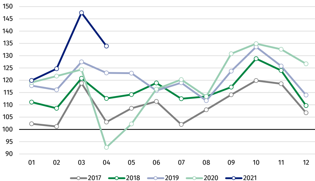
Chart 1. Sold production of industry (average monthly level in 2015=100)

In April 2021, as compared to the previous year, an increase of production was recorded in all main industrial groupings. The production of durable consumer goods went up – by 146.3% (a large decrease of 48.0% in the previous year), capital goods – by 109.5% (a significant decrease of 51.0% in the previous year), intermediate goods – by 43.3% (a decrease of 18.3% in the previous year), non-durable consumer goods – by 14.1% (a decrease of 14.7% in the previous year) and energy – by 7.6% (a decrease of 10.6% in the previous year).