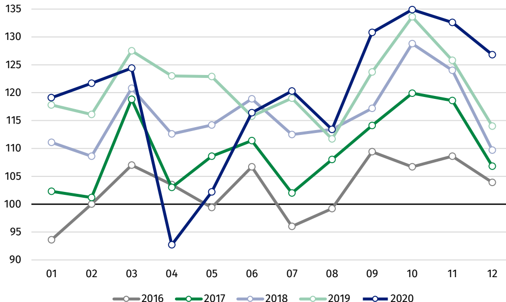
Chart 1. Sold production of industry (average monthly level in 2015=100)

In December 2020, as compared to the previous year, an increase of production was recorded in most of the main industrial groupings. The production of durable consumer goods increased by 30.2%, intermediate goods –by 17.3%, capital goods – by 9.8% and non-durable consumer goods – by 5.0%. A decrease was observed in the production of energy – by 2.7%.