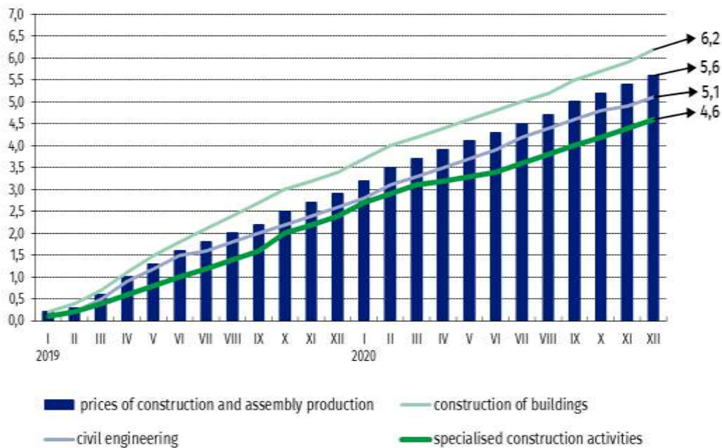
Chart 3. Prices changes of production and assembly construction by divisions NACE in 2019-2020 in relation to December 2018 (in %)

Starting from January 2019 the highest prices growth is recorded in construction of buildings